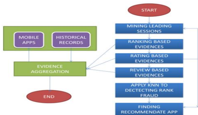
Fig 1: System Architecture Diagram.

identifies the leading sessions of each App predicated on its historical ranking of records. By analysing the ranking demeanors of Apps, we discover that the fraudulent Apps often have different ranking patterns in each leading session compared with mundane Apps. Thus, we identify some fraud evidences from Apps' historical ranking records and develop three functions to obtain such ranking predicated fraud evidences. Further, we propose two types of fraud evidences predicated on Apps' rating and review history. It reflects some anomaly patterns from Apps' historical rating and review records. Fig. 1 shows the framework of our ranking fraud detection system for mobile Apps.