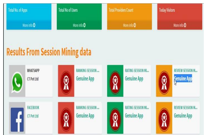
Fig 4: Results of Mining Data.