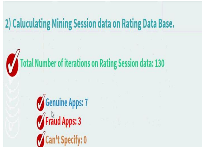
Fig 3: Data Analysis.