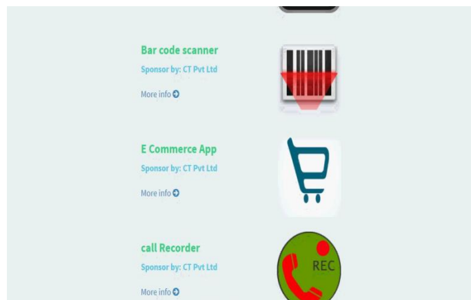
Fig 2: Some Apps.