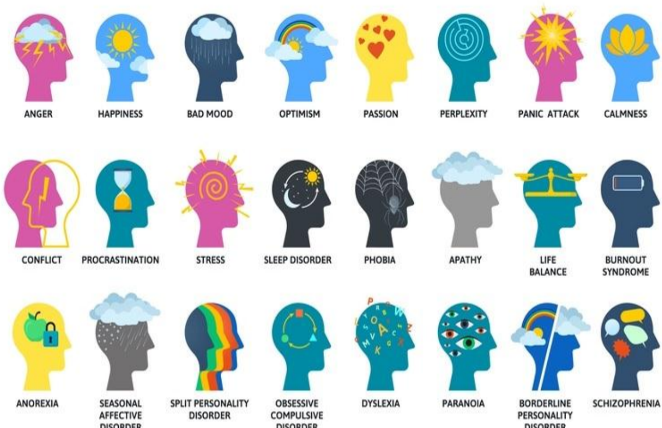
Figure 2: Symptoms for Mood Disorders

Each mood disorder has different symptoms. Generally, the symptoms of a mood disorder include low mood, helplessness, low self-esteem, worthlessness, lack of interest in normal activities, too much or too little sleep, and thoughts of death or suicide. Figure 2 shows the symptoms for mood disorders.